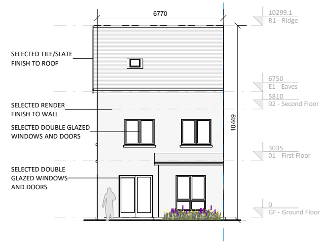
② H06A Rear Elevation 1 : 200