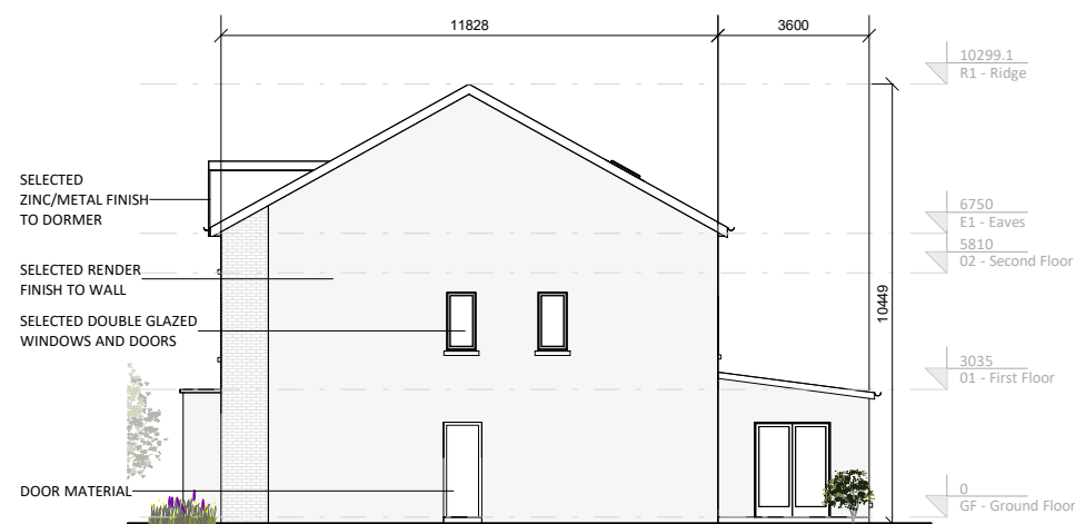
③ H06A Side Elevation (Semi-Detached) 1 : 200