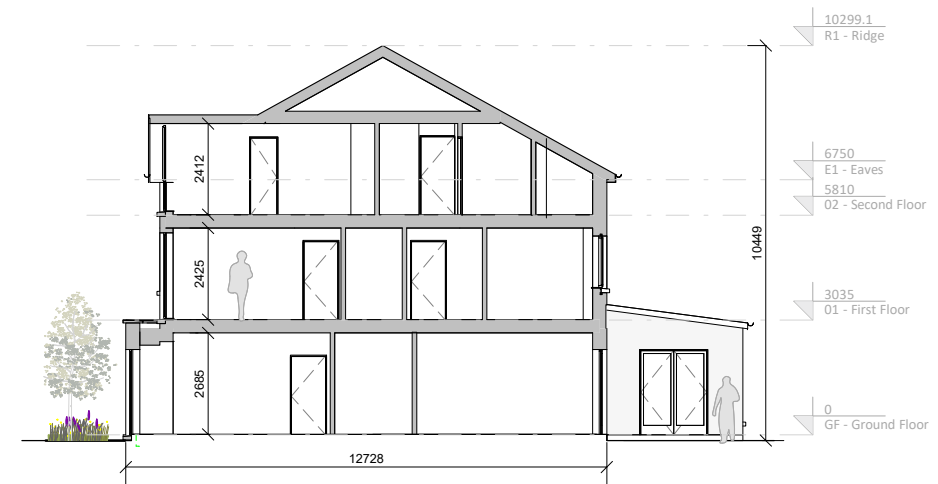
④ H06A Section 1 : 200